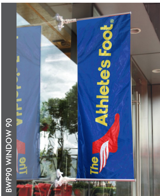
BWP90 WINDOW 90