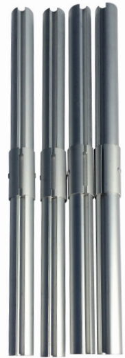
Aluminium Roof Joiner (x4)