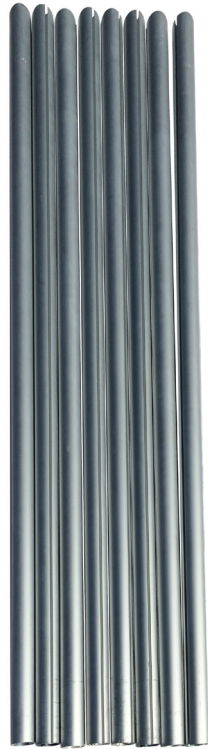
Aluminium Roof Beams (x8)