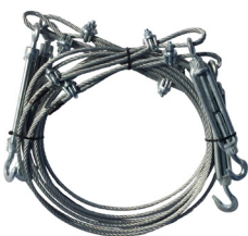
Steel Cross Wires (x2)