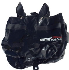
PVC Sandbags (x4)