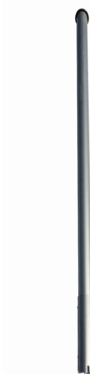
Aluminium Center Pole (x1)