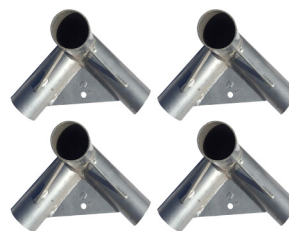
Steel Corner Connector (x4)