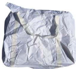
PVC Roof / Protective Cover (x1)